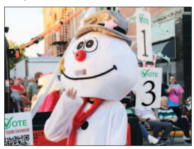
Frosty the Snowman was spotted melting hearts along the Midway. The mascot walked with a float advertising a survey about the city's holiday lights.